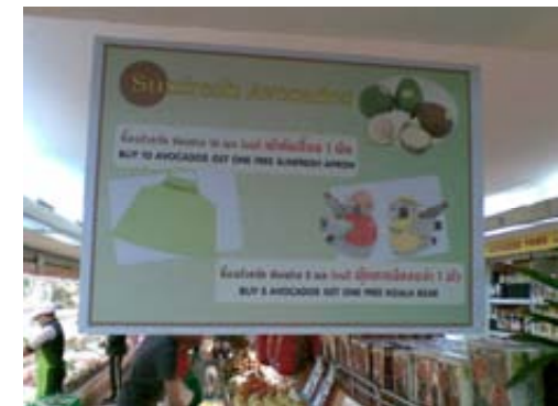
Overhead display promoting Australian Sunfresh avocados in a Foodland retail outlet