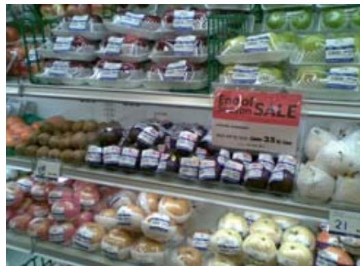
Supermarket avocado promotion