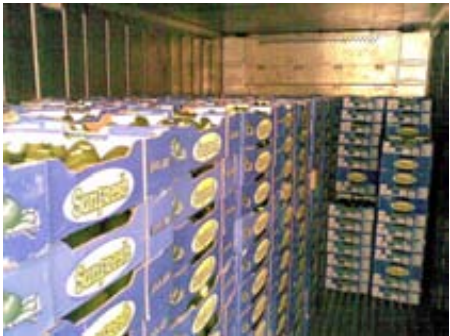
Ripening avocado for distribution at Choice Foods facility in Bangkok