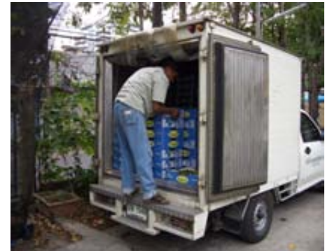
Loading fruit for distribution