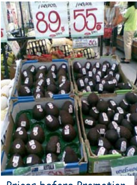
Prices before Promotion